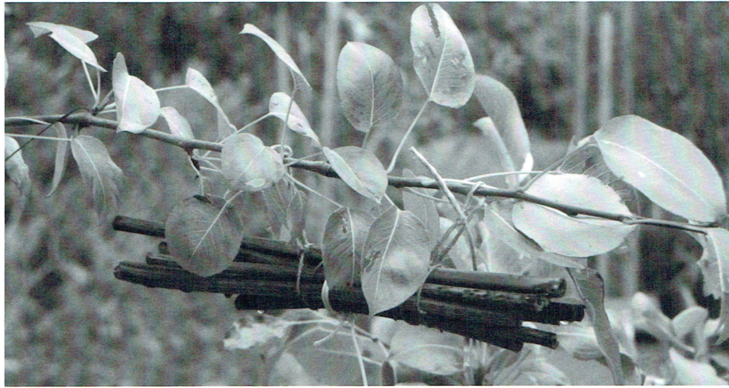
Figure 5. Bundles secured to small tree limb.

Hopefully, by the end of the reproductive season (spring / summer) you will see signs of bees inhabiting your nesting bundles, with some of the pithy centres having been excavated (Figure 6).