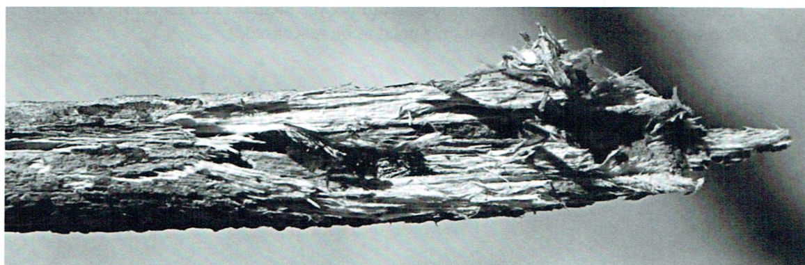
Figure 2. Two Exoneura adults nesting in rotting stems.

The natural nesting habit of Exoneura is in dead and rotting plant stems (Figure 2).